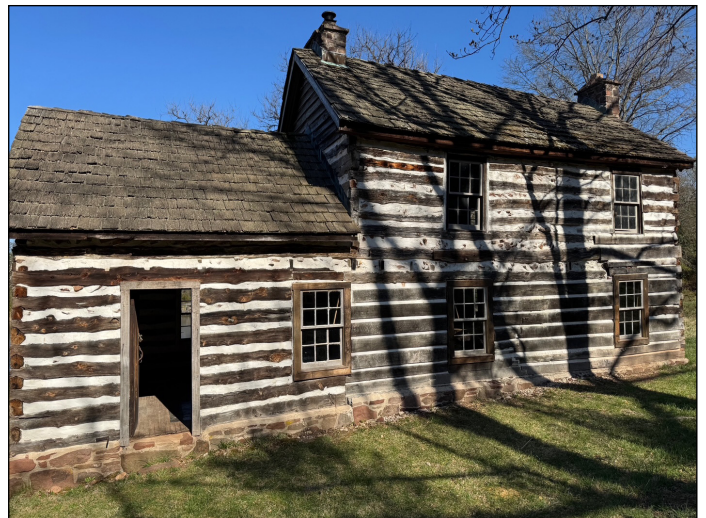
The back side of the Willard Log Cabin

I would like to thank everyone who helped with Spring CleanUp, especially those who helped at the cabin. We have more projects to be done at the cabin. Let me know if you would like to work a few hours on the cabin. There is a lot to do.