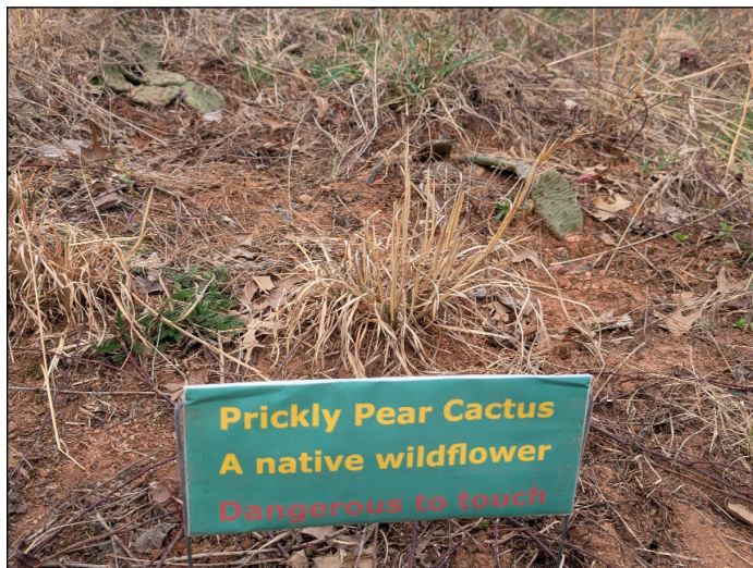
Prickly Pear Cactus by the entrance gate of the Chapter.

Class size is limited to 25, so registering early is recommended. Registration deadline is June 2nd.