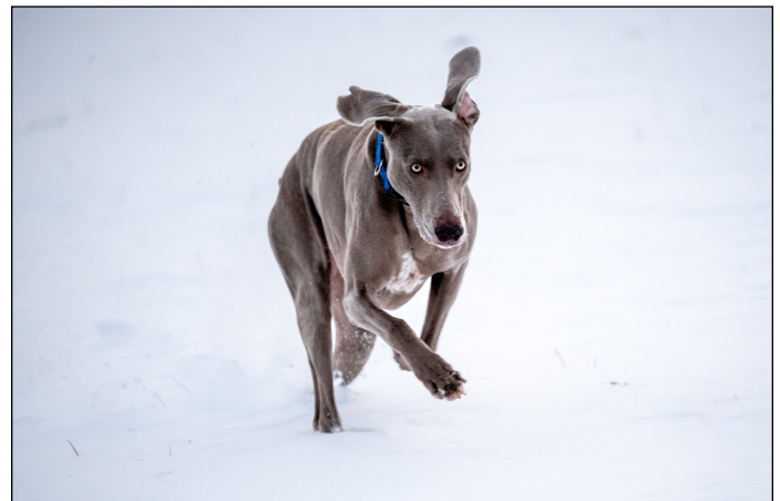
Magic enjoying the snow!