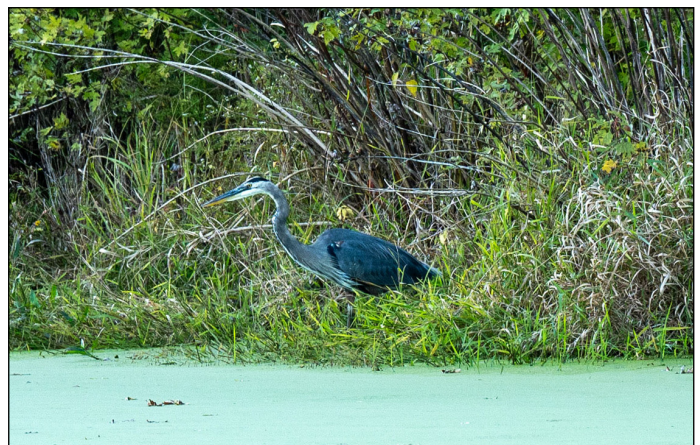
Heron at Pond

The annual New Year's Day brunch will be held on Wednesday, January 1, 2025! More details will be in December's newsletter and future Eblasts.