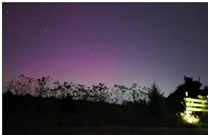
Northern Lights with Dipper