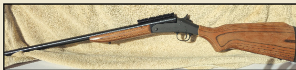
Harrington & Richardson 20 ga. Shotgun rifled bbl. 3" chamber