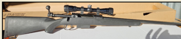
Savage Model 220 20 ga. Shotgun rifled bbl 3" chamber Sporter 3-9x scope

Winner will be chosen during the December 18, 2024 Dinner Meeting