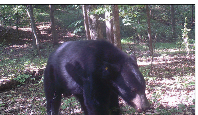
Mr. Bear in West Woods

Saturday, October 5 Starting at 8:30am with lunch at 1:00pm Use the link below to signup: https://www.signupgenius.com/go/ 10C0D4DACAA28A7F8C25-51104914-2024