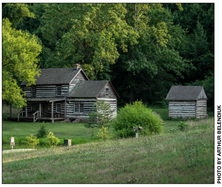
Log Cabin at Sunset

Tuesday Sporting Clays are back starting August 20 at 4:00pm.