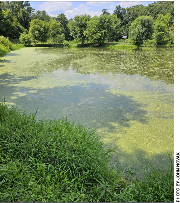
Surface Algae and Pond Weed on Big Pond

Please share this opportunity with veterans and current Service members near the Montgomery County, Maryland area.