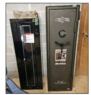
Gun Safe and Cabinet on loan from Maryland Hunter Safety Division