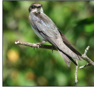
Female Tree Swallow Watching Nest Monitors