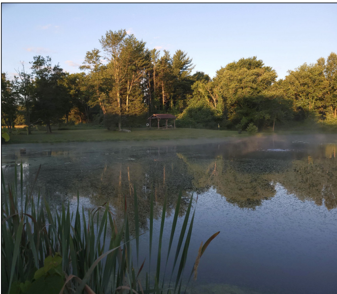
Early Morning at the Large Pond