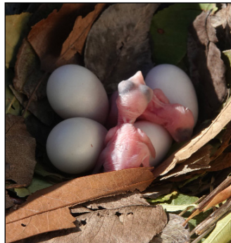
Purple Martin Hatchlings