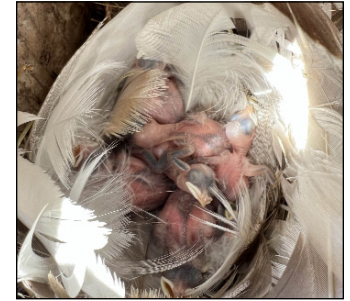
Tree Swallow Hatchlings in Feather-Lined Nest