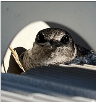
Protective Adult Purple Martin