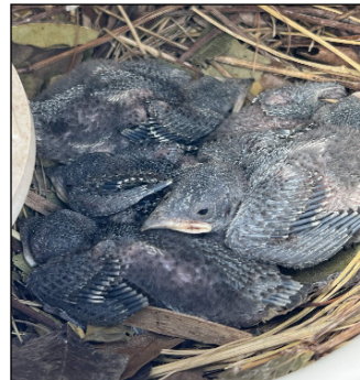
Purple Martin Chicks - 11 days old