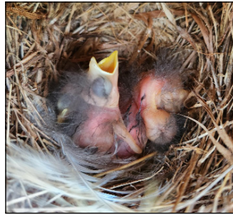
Eastern Bluebird Nestlings - 1 day old