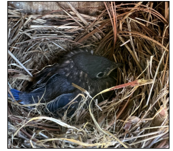
Eastern Bluebird Chick Nearly Ready to Fledge