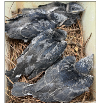
Purple Martin Chicks - 17 days old