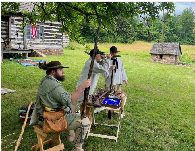
Some of the fun at cabin on Heritage Day

Heritage Days are fast approaching and what a great way to appreciate that heritage than a visit to the Willard Log Cabin. The cabin and outbuildings will be open for you to visit with other events happening around it. Come on down, look around, ask questions, maybe participate in one of the other activities, or you can also just kick back and enjoy. We look forward to seeing you there.