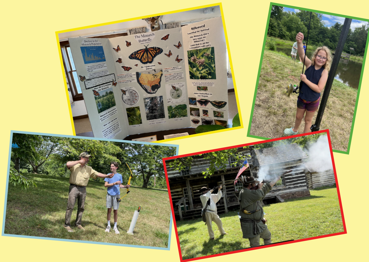
Photos from some of last year's activities.

https://www.signupgenius.com/go/10C0D4DACA28A7F8C25-48781299-2024