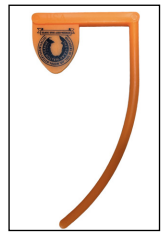
Empty Chamber Indicators (ECI)