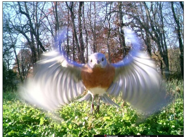
An Eastern Bluebird inspected one of Walt Allensworth's trail cams last month.