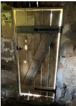
The inside of the spring house door.

Come on down to the cabin when you are here and check it out. While you are visiting the spring house notice that it is dry and has been since May. In all the years that I have been coming to the chapter this is the longest time I remember the spring house being dry.