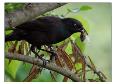
Grackle eating a Cicada

to the next two non-emergence years (2022-2023). The doubling of caterpillar numbers also resulted in a doubling of leaf damage on the oak trees. The team found a similar result at a second field site in Anne Arundel County, suggesting that the avian diet shift and resulting alterations to the forest food web first documented at B-CC IWL are likely to be widespread. The paper was published in the October 20, 2023 edition of Science magazine and featured on the cover. Science magazine is one of the most impactful scientific journals in the world, so the team was thrilled about the publication, which has attracted significant media attention since appearing in print. Free access to the paper can be found on Dr. Lill's website ( https://biology.columbian.gwu.edu/john-lill ) under the Publications tab. We are grateful to B-CC IWL for granting us access to their beautiful forest site, which was ideally suited for our study.