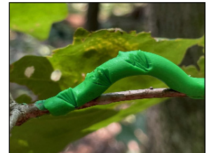
Clay caterpillar with bird beak marks