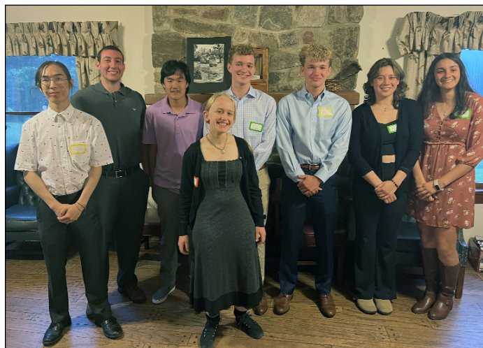
Students from the Global Ecology Program