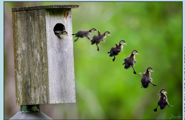
Young wood ducks leaving the nest.