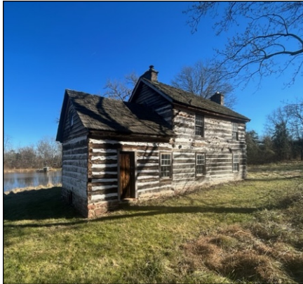
The back of log cabin looking over the small pond.

The picturesque log cabin or Willard Log Cabin that greets everyone as they come to the Chapter is approaching its 200th birthday. Our records show that it was built in 1825. This is something that we should celebrate but a cabin that is