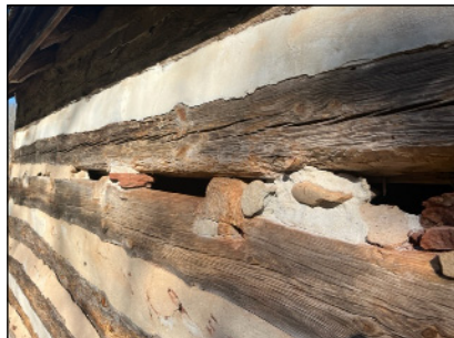
Missing chinking in the smoke house.

If you would like to help us plan for a 200-year birthday party for the cabin, we are putting together a committee or if you would like to help with the maintenance and repair of the log cabin building, please contact me by email. We appreciate any way you can help. If you would like to learn more about the cabin, there is a well written history about it on our website.