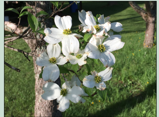
Dogwood blooms at the Archery Range

American novelist Alice Walker writes that "In nature, nothing is perfect and everything is perfect. Trees can be contorted, bent in weird ways, and they're still beautiful." With all their camouflaging leaves on the ground, the gnarled limbs are there for us all to appreciate. There are also lessons of the tenacity of nature written all through chapter grounds. Some of the big oaks are over 100 years old. Huge one-thousand-pound limbs have fallen from the enormous pines you will find on the walk to the big pond yet still they prevail. At the archery range pavilion there is a stunted dogwood with a half rotten trunk that we think will never last another year; yet it has fought on in this state for over 15 years. Every spring it surprises us with another year of beautiful white