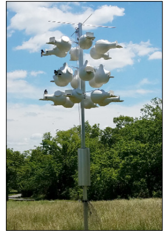
Purple Martin Gourds