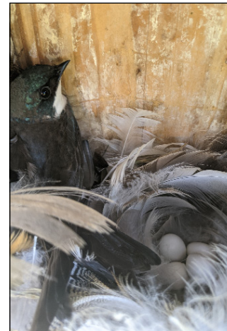
Tree Swallow nest, four eggs, Mama on guard