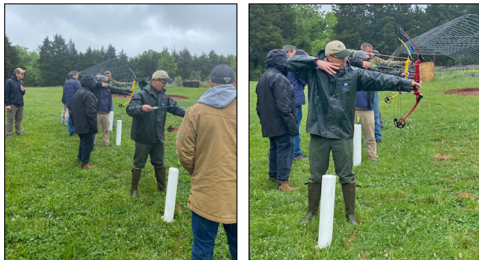
USA Archery Level 1 Instructor Participants