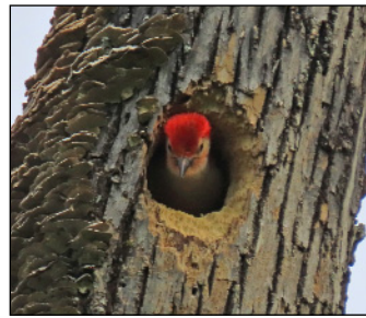
Red-bellied Woodpecker, on nest