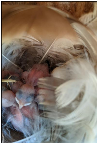
Tree Swallow Nestlings