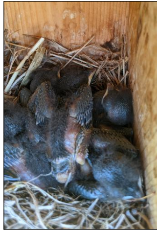
Bluebird Nestlings, seven days old