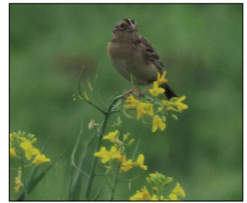
Grasshopper Sparrow on a wild radish