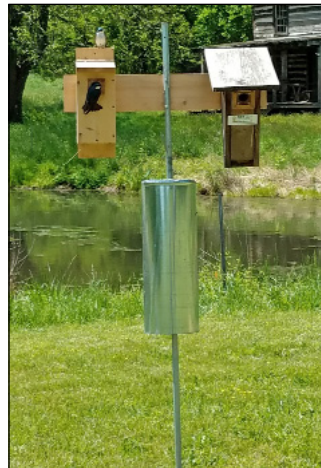
Tree Swallows on nest box, one on top, one looking in the entrance hole