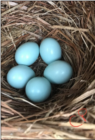
Early April Bluebird Nest, five eggs