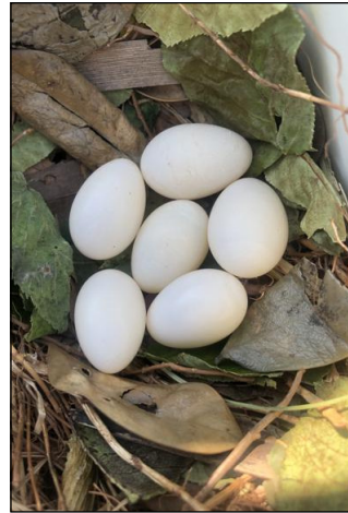
Six Purple Martin Eggs