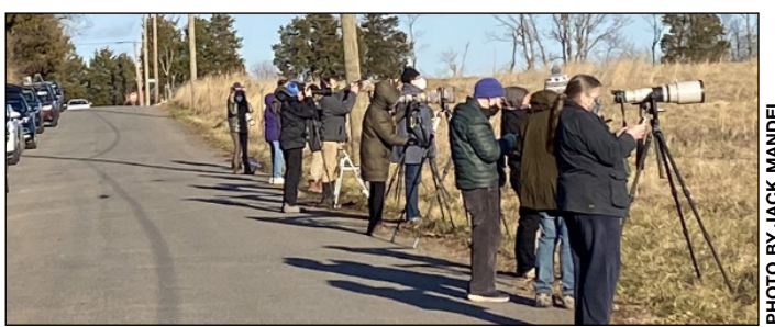
Rocket launch? No, Short-eared Owl watchers on Izaak Walton Way.