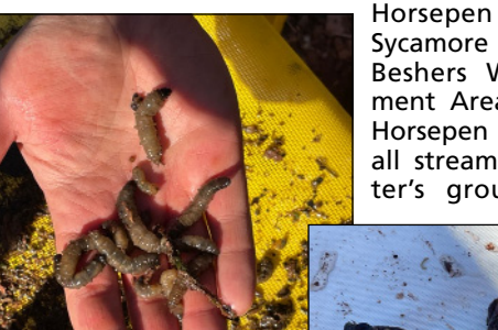
Sycamore Landing in McKee Beshers Wildlife Management Area. This section of Horsepen Branch is fed by all streams from our chapter's grounds as well as

of the streams will be Hookers Branch on Berryville Road that feeds into Great Seneca Creek, and the other will be