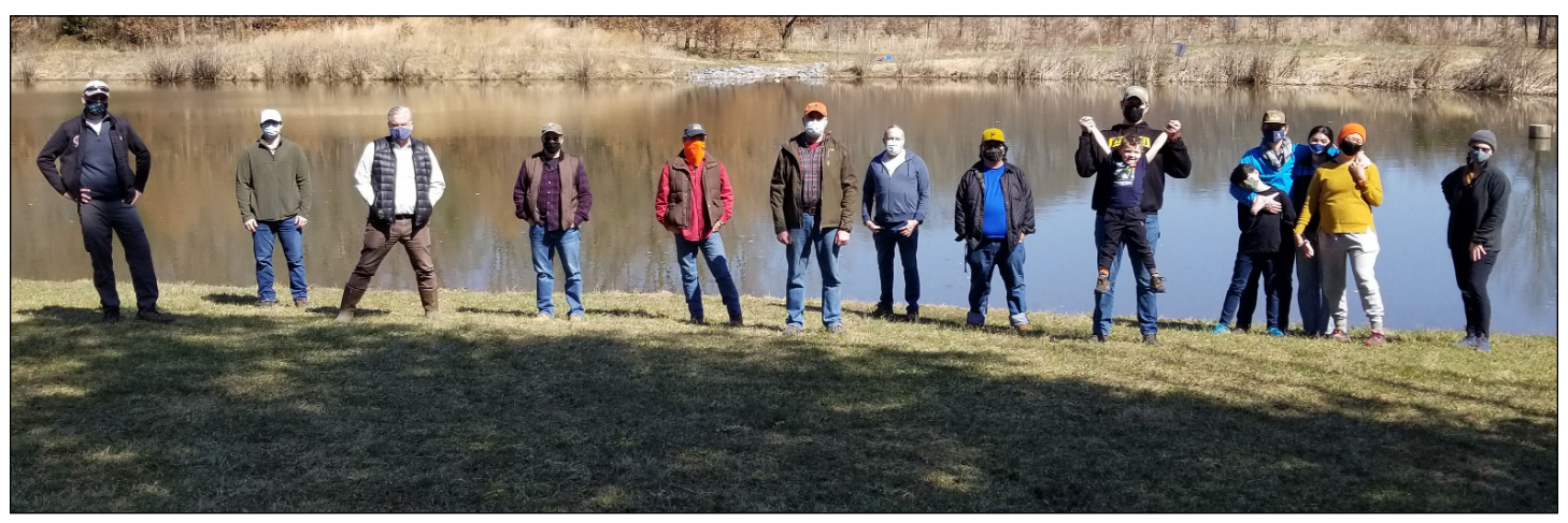
Participants from the March tour (March 21st)