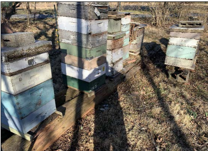
Bees flying around the entrance to their colonies. Bees are present on the far right and far left boxes lower entrances. Kind of hard to see but they are there.