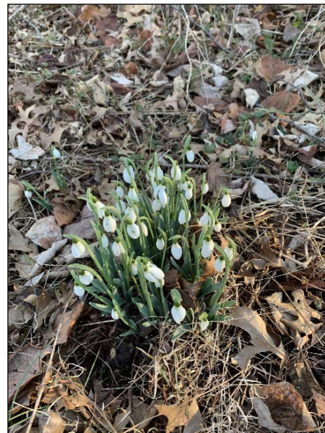
First flowers, Snowdrops, blooming in the bee yard at B-CC IWLA! Welcome back!