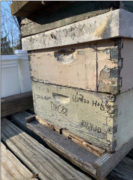
Bees robbing the honey supers that were left overnight in the yard! Bad beekeeping on my part! Never leave honey unsecured!