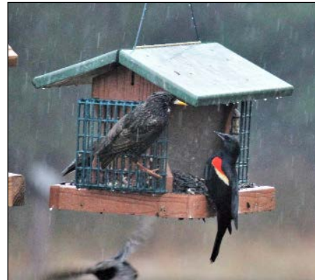
Red-winged Blackbird and European Starlings