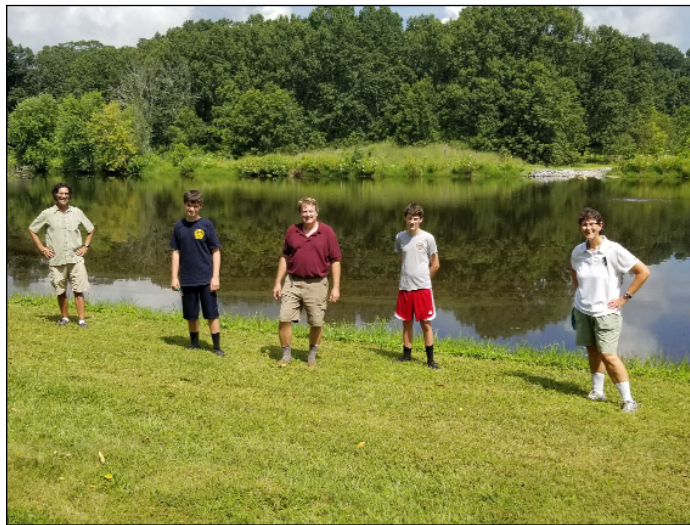
Participants of the August 2020 New-Member Orientation Tour

The September 2020 New-Member Orientation Tour is scheduled for Sunday, September 20th at 10:00am .