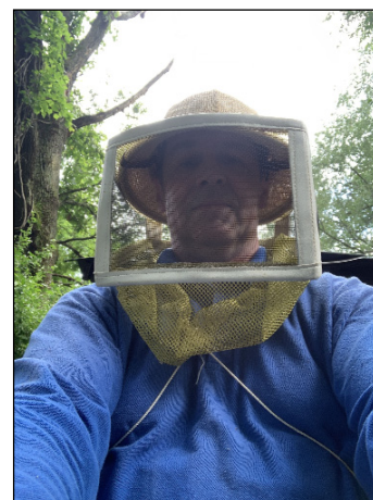
This is me in my bee gear in the yard - a bee selfie.