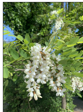
This is the locust tree bloom. This blooms right before the major honey producer - the Tulip poplar tree.