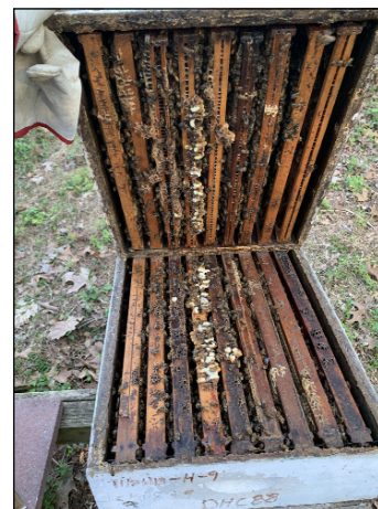
Here is a look inside a box