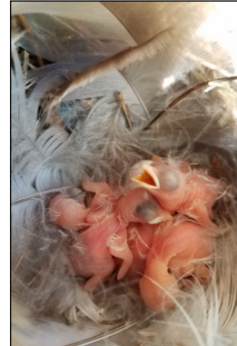
Tree Swallow hatchlings

Please let me know if you would be willing to help out with monitoring the Purple Martin nests. We will have a lot of work in store come late June, because the grasses in each of the 29 nests should be replaced to reduce the incidence of parasites when the chicks are nine or ten days old.