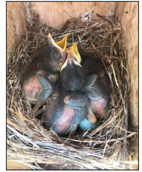
Bluebird Chicks – 10 days old – four chicks, one unhatched egg.

May 30, the martins boasted 29 nests and 71 eggs! All 14 slots in the northernmost house were spoken for; 6 of the compartments in the south house were taken; and 9 of the 12 available gourds were claimed. The average incubation period of Purple Martin eggs is 16 days; after the eggs hatch, the nestlings will develop in their nests for about 28 days. Unlike the swallows and bluebirds, the young martins will return to roost in their houses for a week or so after they fledge.