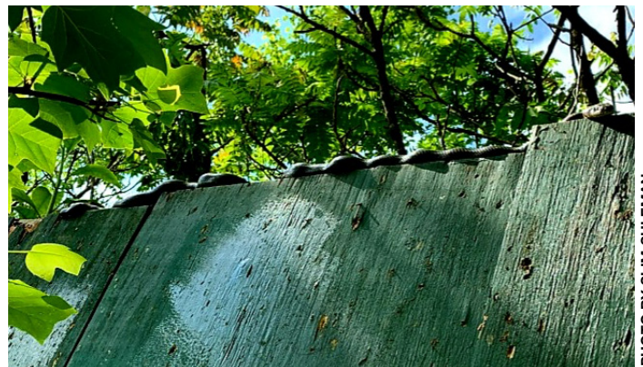
"Artemis" the snake – opening day at the R&P Range.