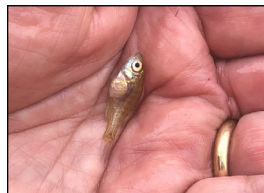
Single Bluegill Fry

at least 20 spawning beds; however, water clarity and overcast skies made it difficult to get an accurate count. Bluegill have been known to spawn in colonies numbering 100 nests and may spawn multiple times from May to October. The male bluegill builds and guards the spawning nest while the female, after spawning, moves on and spawns with other males at other nests.