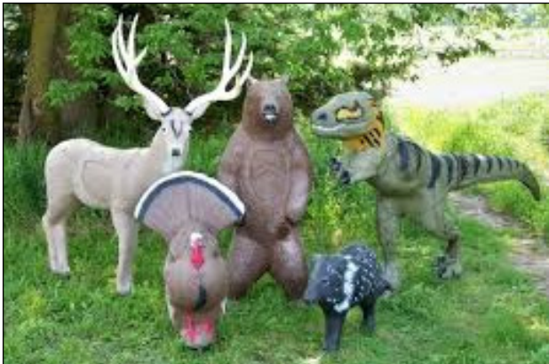
Life-sized animal targets are set up throughout the woods.

The 3-D targets have been serviced and set, all bridges are safe and functional, and the trails have been cleared of all of the many fallen trees.