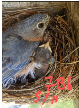
Mama bluebird with 6-day-old nestling

Tree Swallows, like Eastern Bluebirds, do not return to the nestbox at night. Our Tree Swallows began laying eggs in early May. As of late May, the swallows had produced 61 eggs of which 26 had hatched.