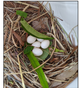
Purple Martin Nesting