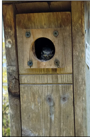
Bluebird nestling peeking out of its box

Tree Swallows typically begin nesting a little later than the bluebirds and have only one nest per season. Each clutch typically has five or six eggs. After an incubation period of 15 days, nestlings spend about 20 days in the nestbox before taking flight.