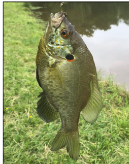
Adult Redear Sunfish

The bluegill ( Lepomis macrochirus ), the most numerous resident of the big pond (Walton), is a member of the sunfish family Centrarchidae. But the bluegill is not the only sunfish in the pond. There are two other species – the redear sunfish and the largemouth bass. Interestingly, the largemouth bass preys on its bluegill family members and that is why bluegills are often stocked in ponds and lakes – to support the largemouth bass fishery. Usually about 10 bluegills are stocked to one largemouth bass. However, bluegills themselves provide a recreational fishery. To support both the largemouth bass and bluegill fishery in the big pond, in 2018 the Pond and Streams Committee stocked about 1,000 bluegills in the big pond to supplement the existing population and to provide additional forage for the largemouth bass population.