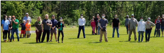
Members ARE getting out to the chapter NOW and ARE socially-distancing.

The June 2020 New-Member Orientation Tour is scheduled for Sunday, June 21 . A beautiful walk around the Conservation Farm would make for quite a memorable family outing on Father's Day after everyone's being cooped up for so long!