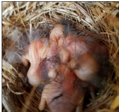
Bluebird nestlings, one day old