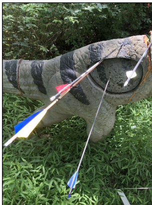
Finishing strong in the 3D tournament, we all scored on the velociraptor

course back up. Most of us will be out hunting, shooting the bags on the range, or just enjoying the weather. I hope to see you out there.