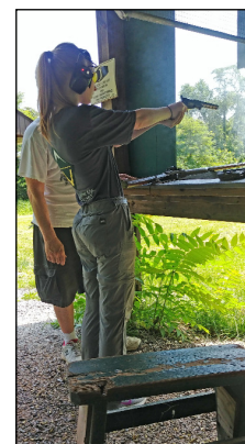
1851 Naval Revolver