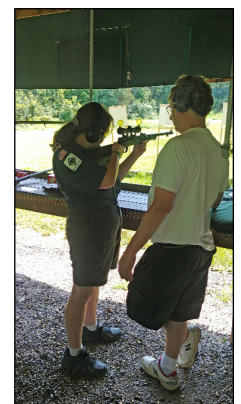
Inline .50 Rifle