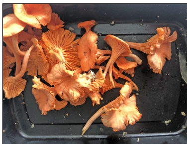
Chanterelles found along the trail in the archery woods

Archery activities slow down until next April when we set the