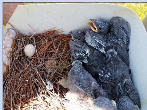
14 days old