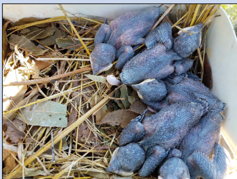
10 days old