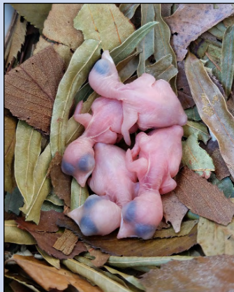
1 day old