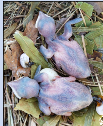
5 days old