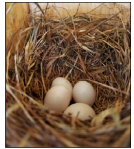
Eastern Bluebird Eggs – White Eggs instead of Blue-unusual