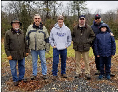
January New Member Orientation Tour

We are still working to overcome the previously unforeseen data issue that directed a significant number of renewal invoices to incorrect addresses.