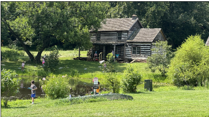
The cabin area being used by a summer camp.

If there are other times you would like to help, I am usually at the cabin at least one day during the week. Drop me a line at dmecklenburg1@gmail.com and let me know your availability.