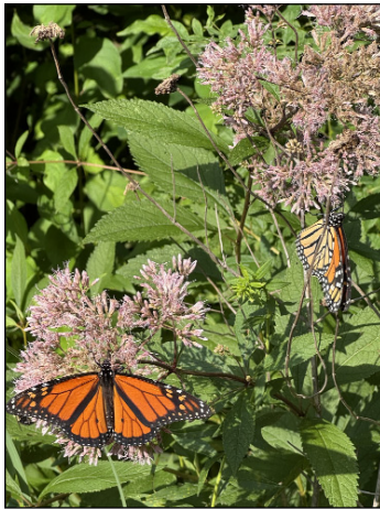
Monarch butterflies on Joe Pye Weed, a native plant that likes wet soil and is a great pollinator friendly plant.