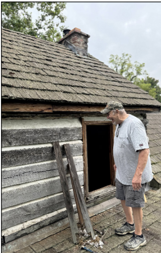
Redoing the windows on the cabin.