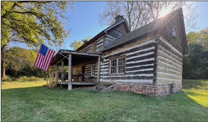
The front of the cabin with the updated windows.

We finished redoing all the windows, so they all are working as well as secure. The re-casing the windows involved taking each window completely apart and rebuilding it, about 20 manhours for each window. Thank you, Curt Bush, for all of your work and guidance. We still need to paint and caulk all the windows. If you would like to help, please email me. We may have to wait until the weather warms in the spring for the outside, but we may be able to work inside. So please email me at dmecklenburg1@gmail.com if you are willing to help. I will create an email list and contact you only when we have a painting date scheduled.