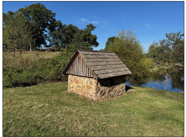
Looking at the chapter house over the spring house from the cabin.