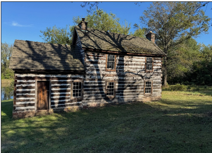
The back of the cabin with updated windows.