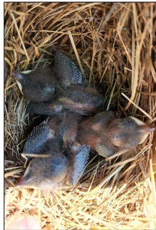
Young Bluebird Chicks