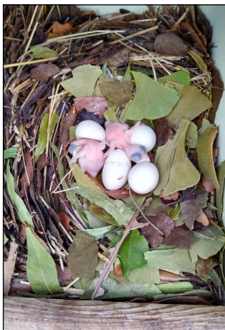
Newly Hatched Purple Martins