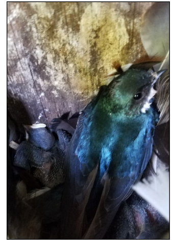
Mother Tree Swallow with nestlings