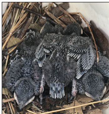
Purple Martin Chicks - 11 days old