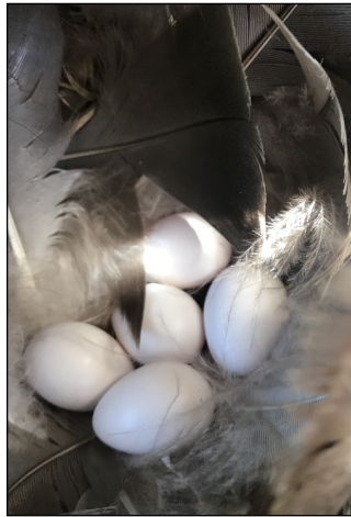
Tree Swallow Eggs