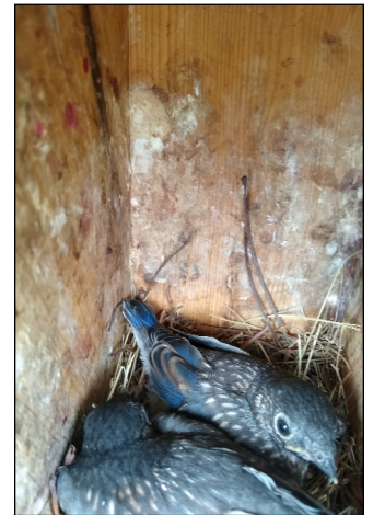
Eastern Bluebird Chicks