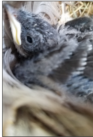
Tree Swallow Nestling – about 8 days old