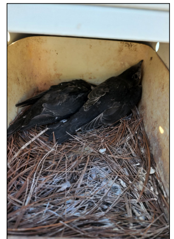
Purple Martins almost to the point of fledging