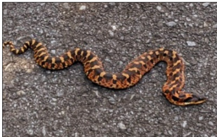
Meet Mortimer, an Eastern Hog-Nosed Snake