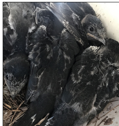
Purple Martin Chicks - 18 days old