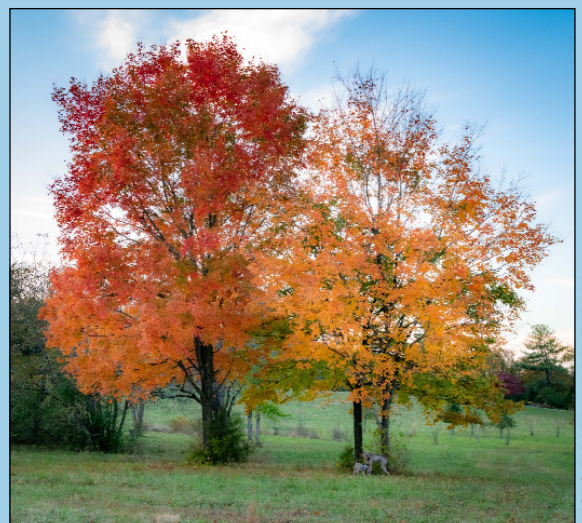
Trees in the field between the gardens and chapter house