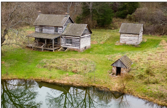
Aerial view of log cabin and out buildings