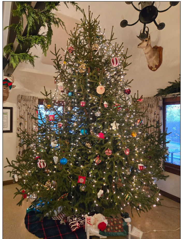
Chapter House Christmas Tree

We still need to paint and caulk all the windows. If you would like to help, please email me. We may have to wait until the weather warms in the spring for the outside, but we may be able to work inside. So please email me at dmecklenburg1@gmail.com if you are willing to help. I will create an email list and contact you only when we have a painting date scheduled.