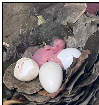
Purple Martin surprise hatchling!