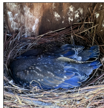
Eastern Bluebirds about to fledge