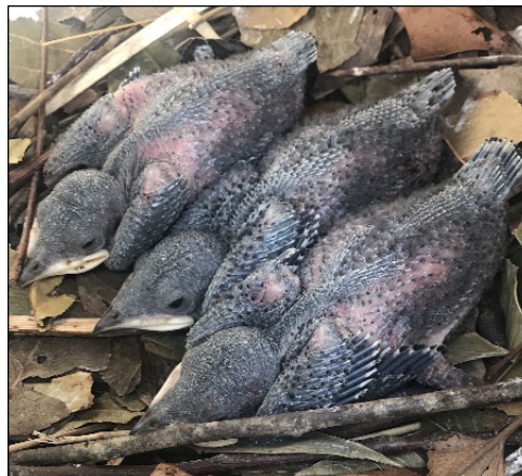
Purple Martins, July 21