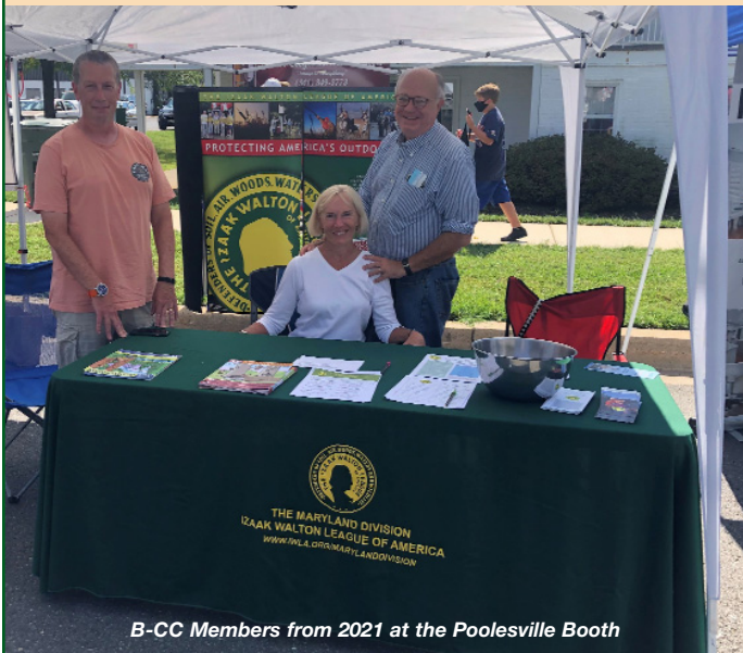
B-CC Members from 2021 at the Poole'sville Booth

https://www.signupgenius.com/go/10C0D4DACA28A7F8C25-poole'sville1