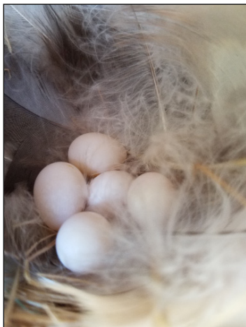
Tree Swallow Eggs