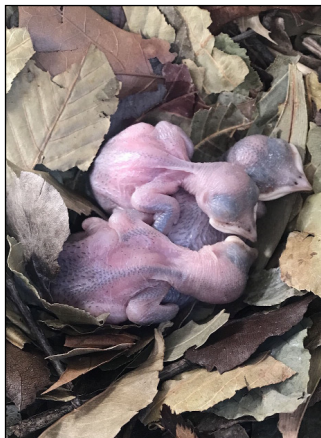
Purple Martins, July 15