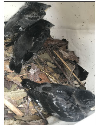
Purple Martins, July 28