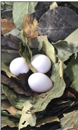
Purple Martin Eggs, June 30