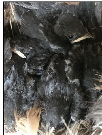
Tree Swallows, July 8