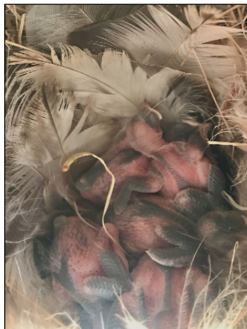
Tree Swallows, June 30